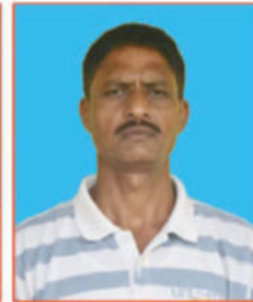
Abul Kalam Azad Economics Deptt.